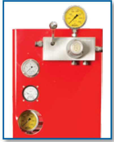
Hydrostatic Test Station with Jetstream HTV