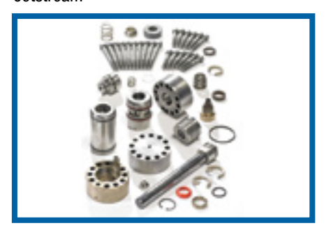
The other guys