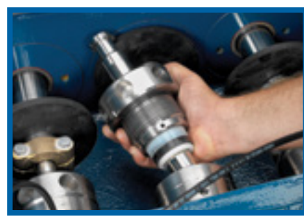
5-minute packing change