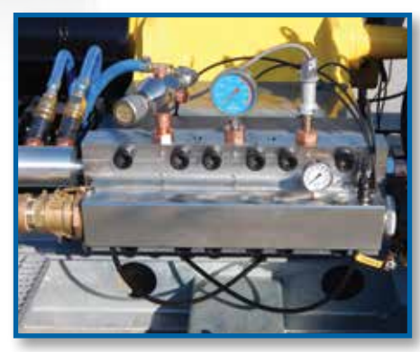
UNx Fluid End